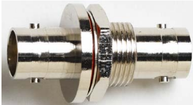
6744 BNC (F/F) Panel Mount Hermetically Sealed-75 Ω